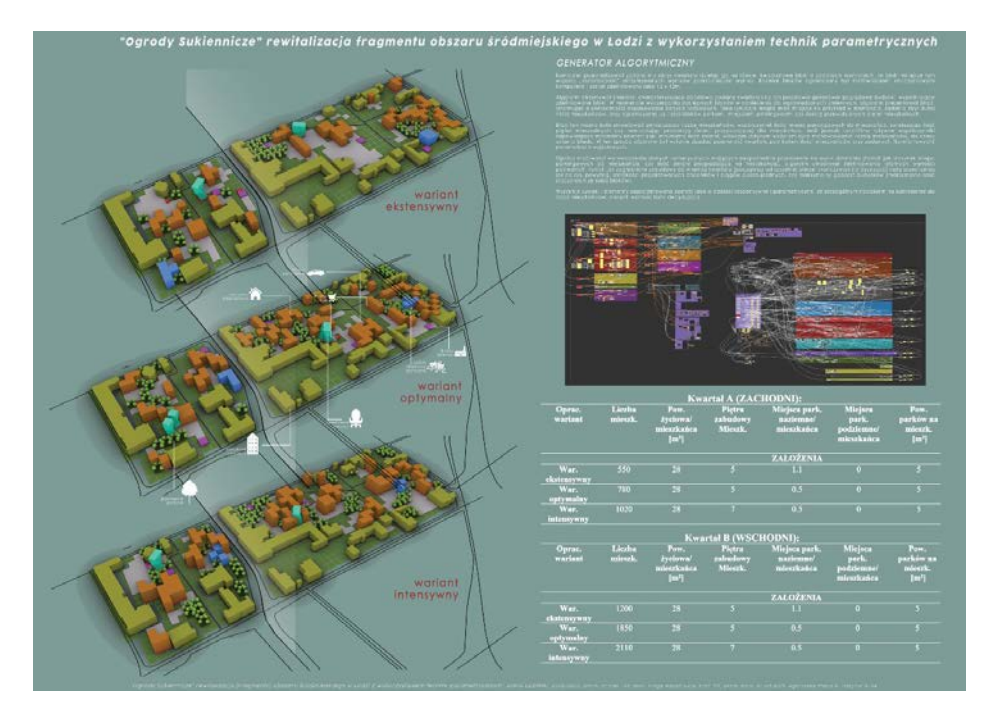
Figure 2: Stage II - urban model simulation based on MUPS guidelines.

At this stage, it is essential to evaluate each model by an assessment team comprising representatives from the municipal planning institution, teachers and the diploma candidate. The evaluation is based on numerical data generated for the models, which allow an assessment of the future intervention into the city's urban structure. The data obtained using parametric techniques enabled the analyses of expected impacts of loads introduced into the structure of blocks A and B under design (indicated by the MUPS) as part of three urban models.